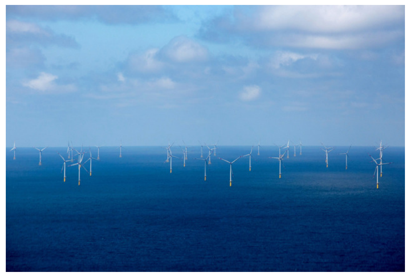
Wind turbines operate at Nordsee Ost wind farm.

Some 170 wind mills are rotating, with undersea grid cables spanning a distance of about 90 kilometers that connect the generators to the mainland, producing enough power to serve 900,000 households for as long as 25 years.