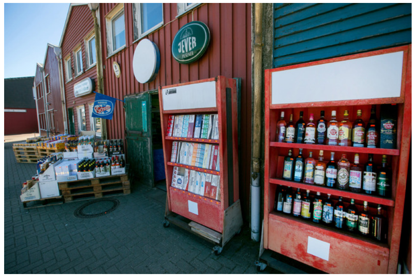
A deserted duty-free shop. Tourist numbers have dwindled on the archipelago, cutting demand for alcohol and tobacco.

The Tiny Islands at the Heart of Germany's Offshore Wind Boom - Bloomberg