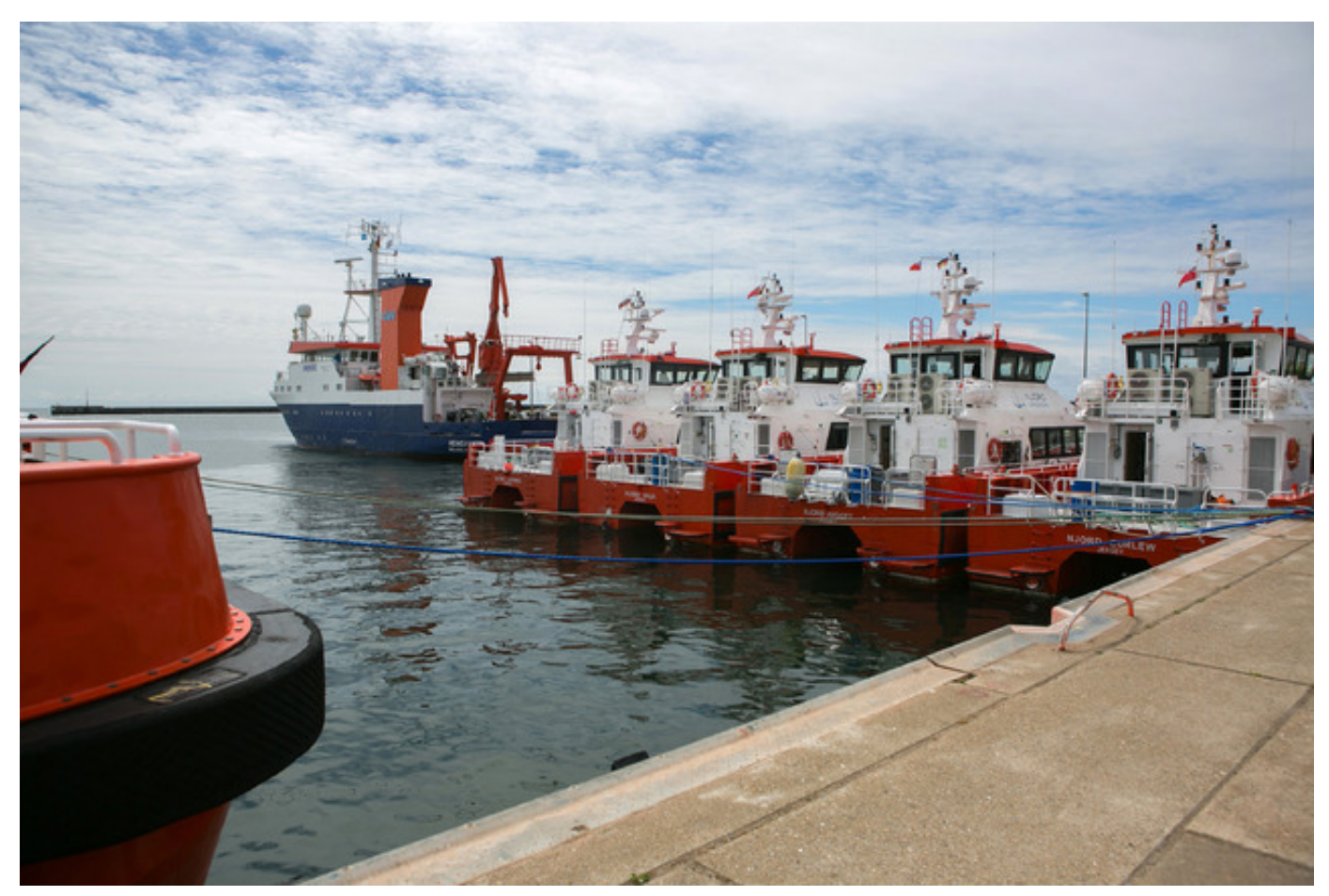
Wind farm crew transfer vessels sit moored in the harbour on the archipelago of Heligoland, Germany.